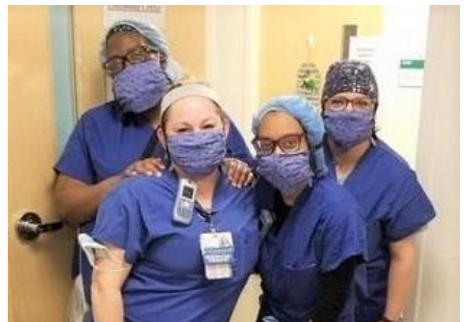
Respiratory therapists wearing masks sewn by Village Quilters.